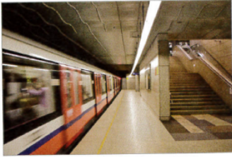
4. a subway