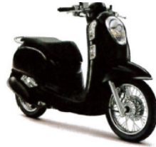
3. a moped