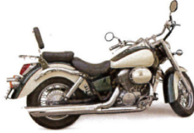
5. a motorcycle