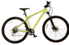
2. a bicycle