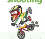
downhill mountain biking