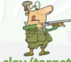
clay (target) shooting