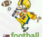
football American football