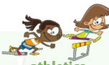
athletics (track and field)