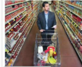
8. a supermarket