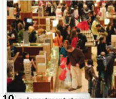
10. a department store