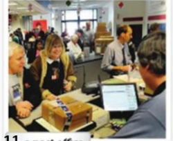
11. a post office

Exercise 1. Translate to Spanish the vocabulary above (Traduce al español el vocabulario de arriba).