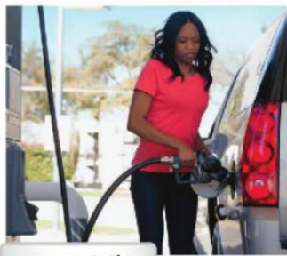
c. a gas station