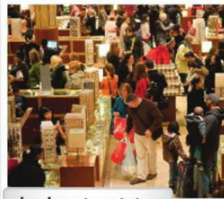
d. a department store