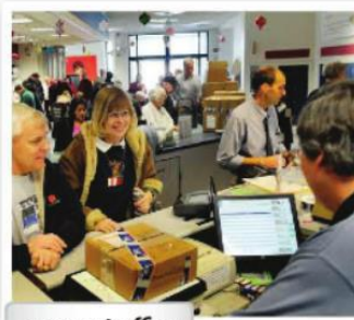
a. a post office