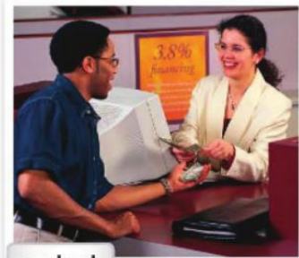
e. a bank