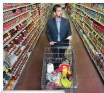
h. a supermarket

B PAIRWORK What else can you get or do in the places in part A?