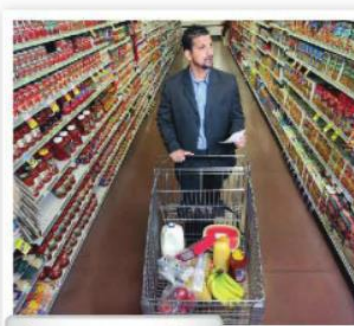
h. a supermarket

B PAIRWORK What else can you get or do in the places in part A?