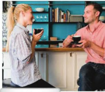
g. a coffee shop