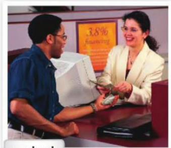
e. a bank