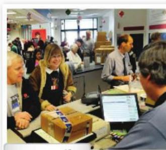
a. a post office