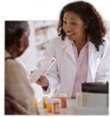
1. a pharmacy