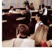
3. a bank