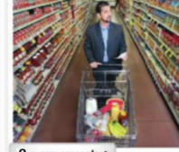
8. a supermarket