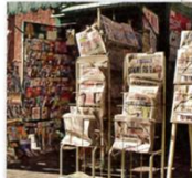
5. a newsstand