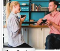
7. a coffee shop