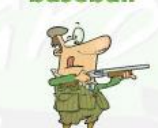
clay (target) shooting