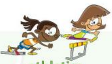
athletics (track and field)