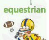
football American football