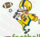
football American football