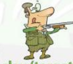
clay (target) shooting