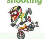
downhill mountain biking