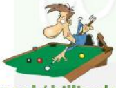
pool / billiards