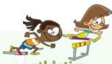
athletics (track and field)