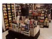
6. a bookstore