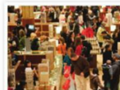
10. a department store