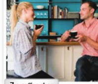
7. a coffee shop