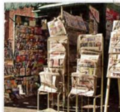
5. a newsstand