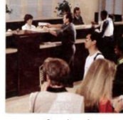
3. a bank