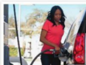
9. a gas station