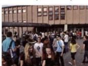
4. a school