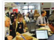
11. a post office

Exercise 1. Translate to Spanish the vocabulary above (Traduce al español el vocabulario de arriba).