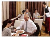
2. a restaurant