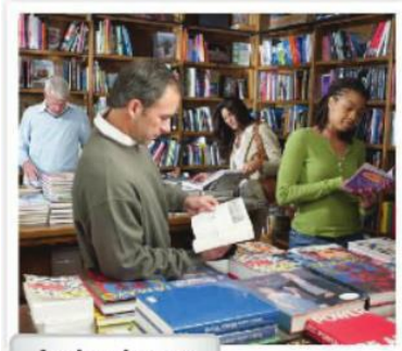
f. a bookstore