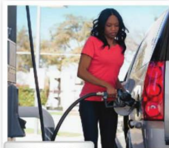
c. a gas station