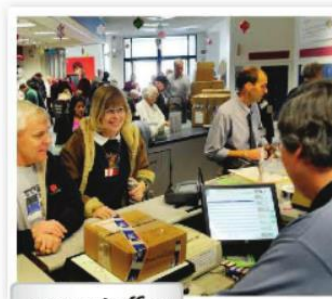
a. a post office