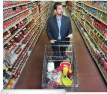
h. a supermarket

B PAIRWORK What else can you get or do in the places in part A?