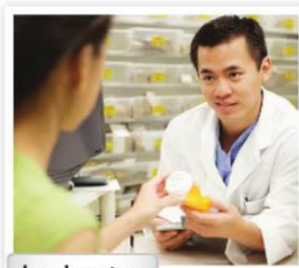
b. a drugstore