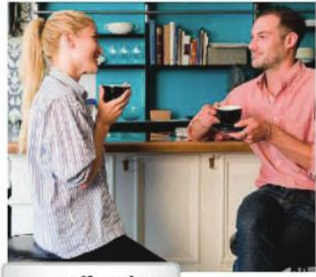
g. a coffee shop