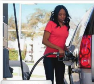
c. a gas station