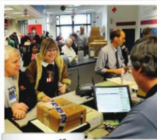
a. a post office