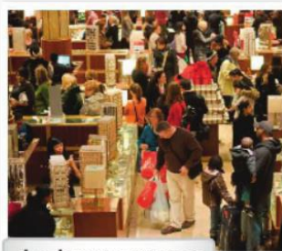
d. a department store