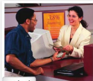
e. a bank

(2-G) (3-F) (4-C) (5-H) (6-A) (7-D) (8-E)