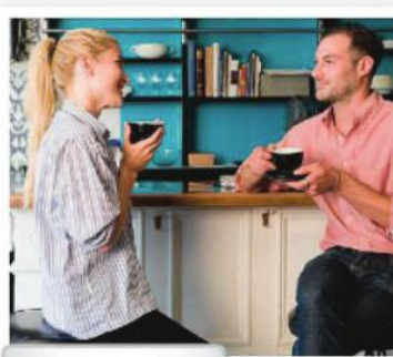
g. a coffee shop