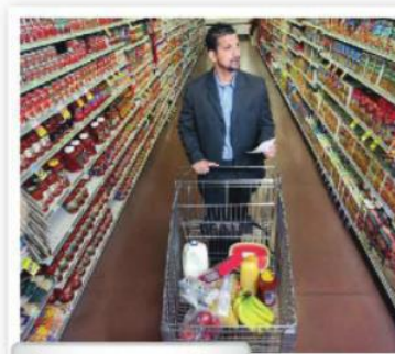
h. a supermarket

B PAIRWORK What else can you get or do in the places in part A?