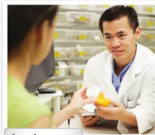
b. a drugstore