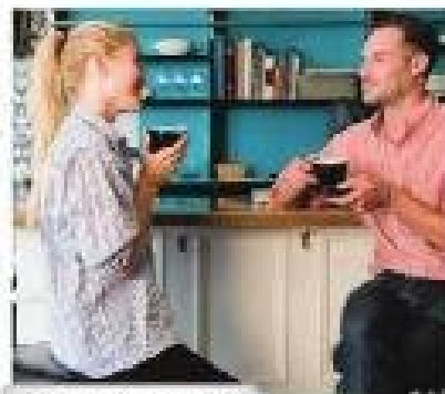
g. a coffee shop