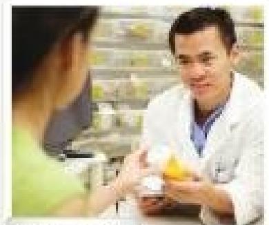
b. a drugstore