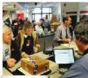
a. a post office