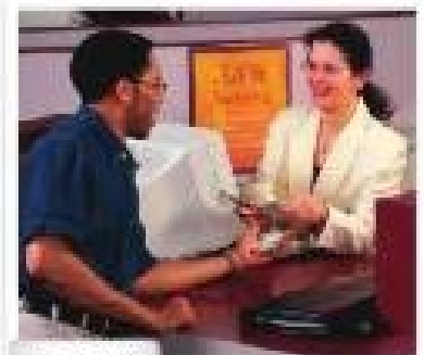
e. a bank