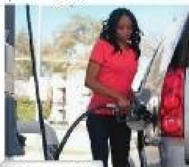
c. a gas station