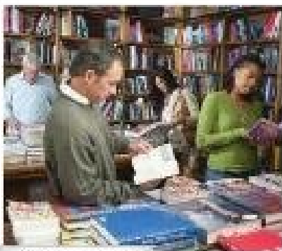
f. a bookstore