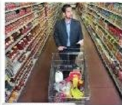
h. a supermarket