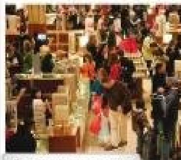
d. a department store