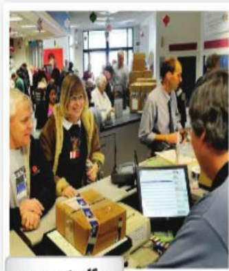
a. a post office