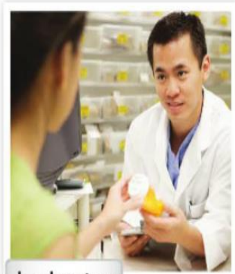
b. a drugstore