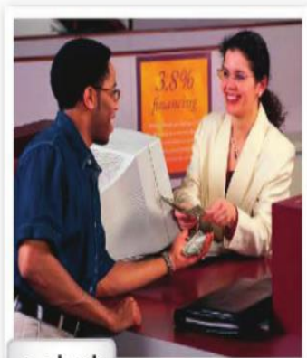
e. a bank