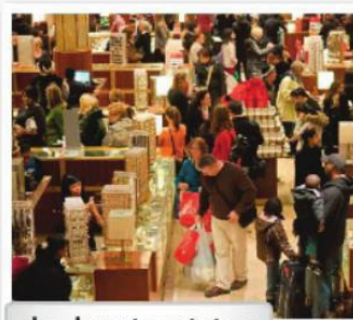
d. a department store