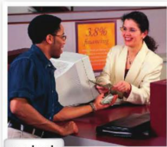
e. a bank