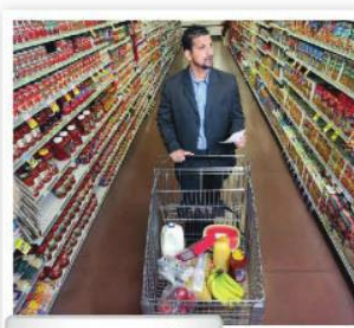
h. a supermarket

B PAIRWORK What else can you get or do in the places in part A?