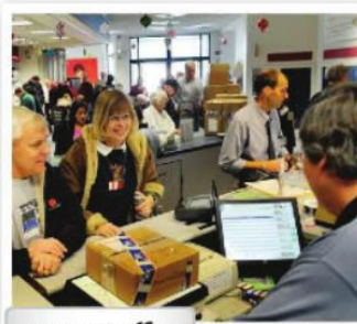
a. a post office