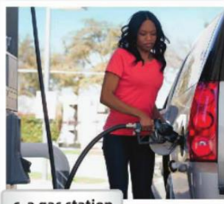
c. a gas station