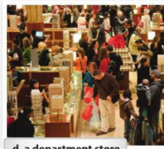
d. a department store