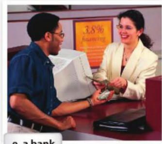
e. a bank