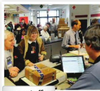
a. a post office