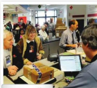
a. a post office