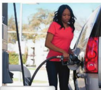
c. a gas station