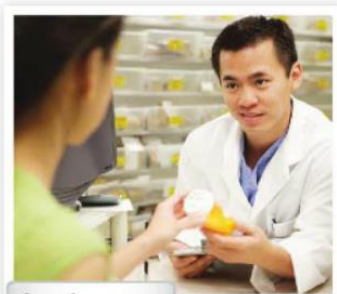
b. a drugstore