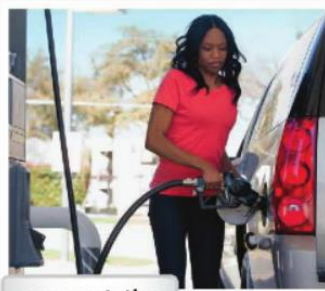
c. a gas station