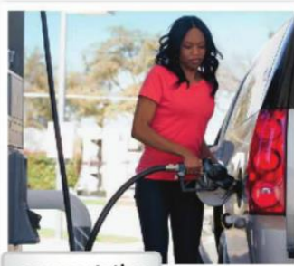
c. a gas station