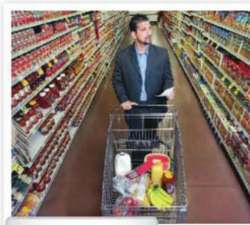
h. a supermarket

B PAIRWORK What else can you get or do in the places in part A?