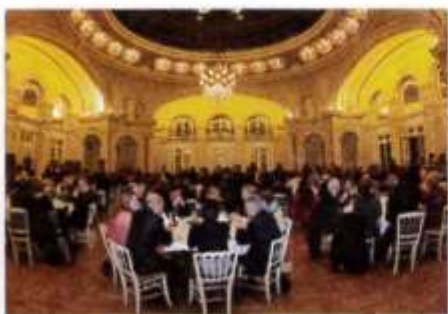
4. a dinner