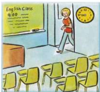
1. She's early.