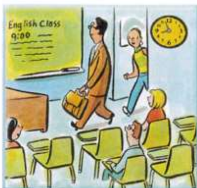
2. They're on time