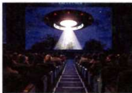
5. a movie