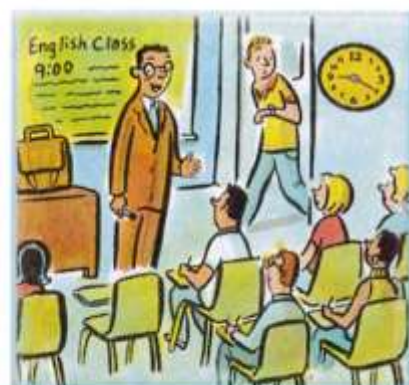
3. He's late