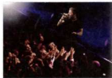
6. a concert