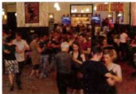
2. a dance