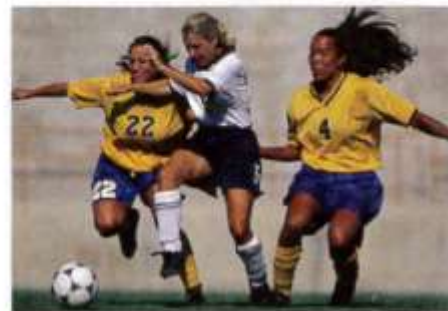
3. a game