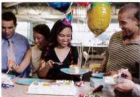
1. a party