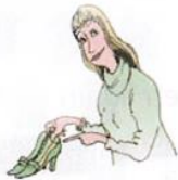
6. These sneakers