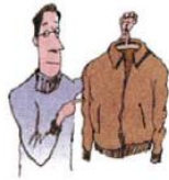
2. That sweater