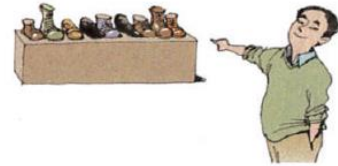
4. those shoes