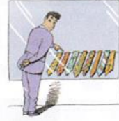
8. these ties

GRAMMAR - The Present Simple tense: affirmative statements with "like", "want", "need" and "have".