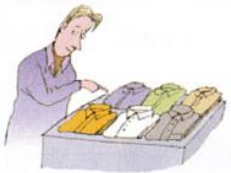
5. These shirts