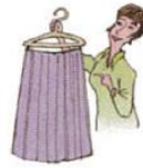
3. That skirt