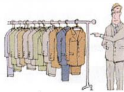
7. this suits