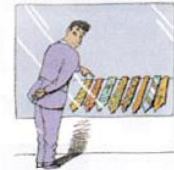
8. These neckties

GRAMMAR - The Present Simple tense: affirmative statements with "like", "want", "need" and "have".