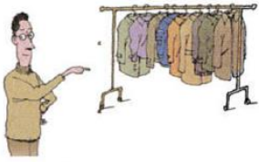
1. Those jackets

Exercise 2. Look at the pictures. "Write "this", "that", "these", or "those" and the name of the clothes.