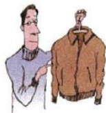
2. This sweater