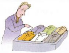
5. These shirts