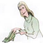
6. These heels.