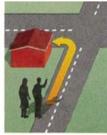
3. around the corner