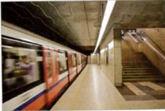
4. a subway