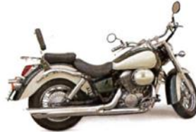
5. a motorcycle