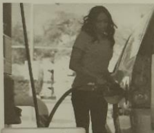
c. a gas station