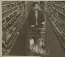
h. a supermarket

B PAIR WORK What else can you get or do in the places in part A?