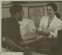
e. a bank