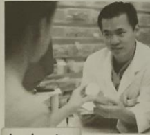
b. a drugstore