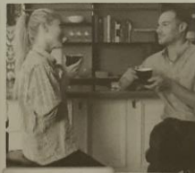
g. a coffee shop