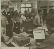
a. a post office