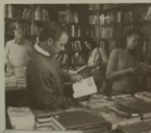
f. a bookstore