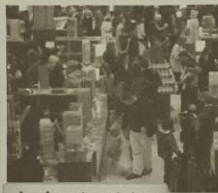
d. a department store