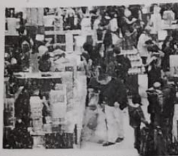
d. a department store