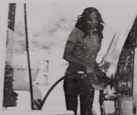
c. a gas station