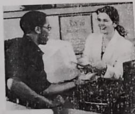
e. a bank