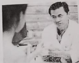
b. a drugstore