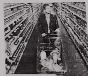
h. a supermarket

B PAIR WORK What else can you get or do in the places in part A?