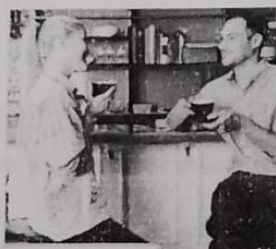
g. a coffee shop