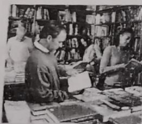
f. a bookstore