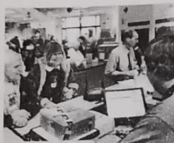
a. a post office