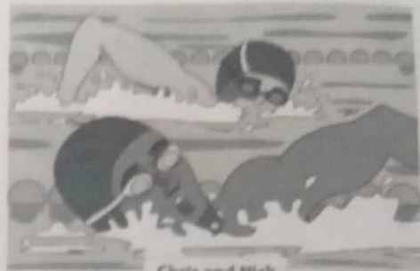
Chris and Nick

2. Can Chris and Nick swim? Yes, They can.