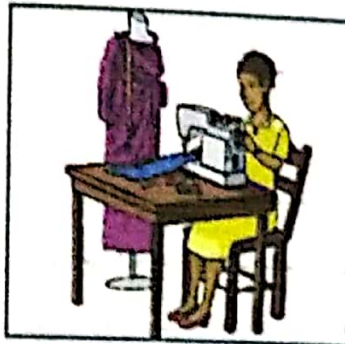
make your own clothes