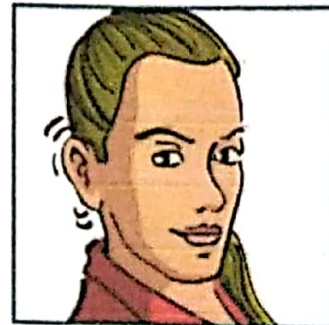
wiggle your ears

A: Can you play two musical instruments?