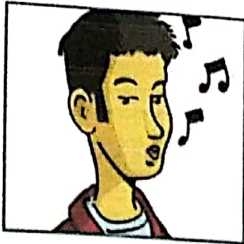
whistle a song