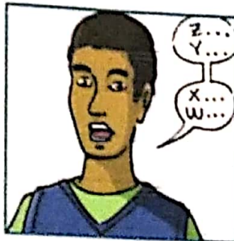
say the alphabet backward