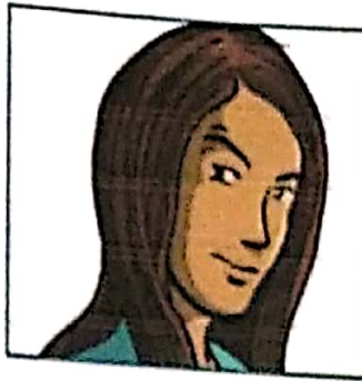
raise one eyebrow