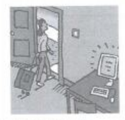
Make sure to turn off your computer.