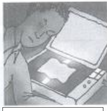
remember to close the copier