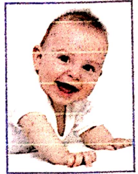
8. cute ✓