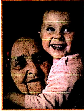
3. old ✓ 4. young ✓