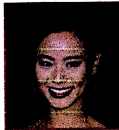
5. pretty ✓