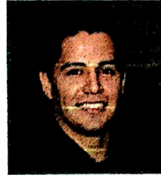
6. handsome ✓