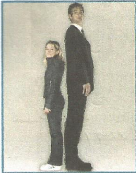
1. short 2. tall