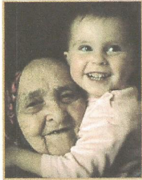
3. old 4. young