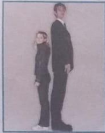
1. short 2. tall