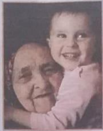
3. old 4. young