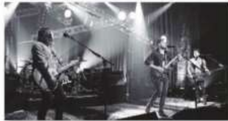
2. The Kings of Leon are A rock band