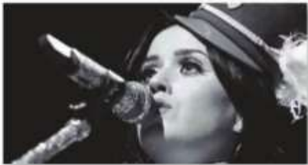
1. Katy Perry is A Singer