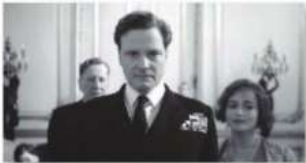
3. Colin Firth is An actor