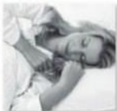
1. She's sleeping