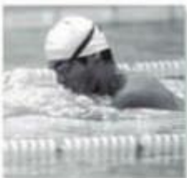
2. He's swimming