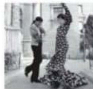
9. They're a dancing