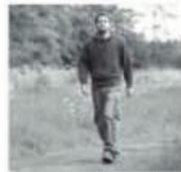
6. He's take a walking