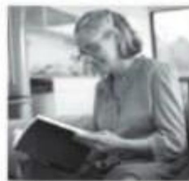
8. She's reading a book