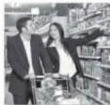
5. They're shopping