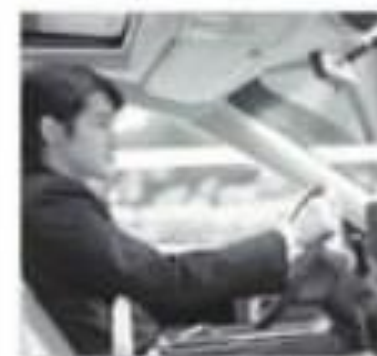
7. He's drive