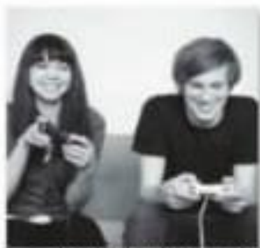
3. They playing a video games