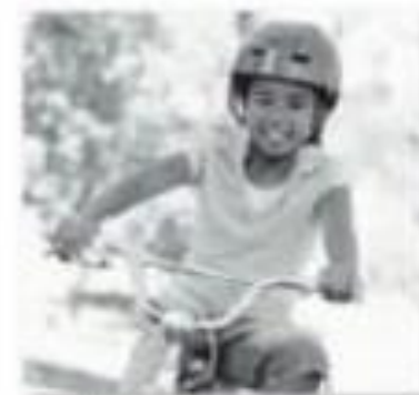
4. She's ride a bike