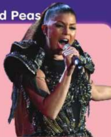
▲ performing at the World Cup