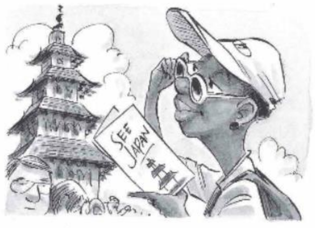
4. A: Is she in Mexico?

B: _ No, they are not, they are in new york