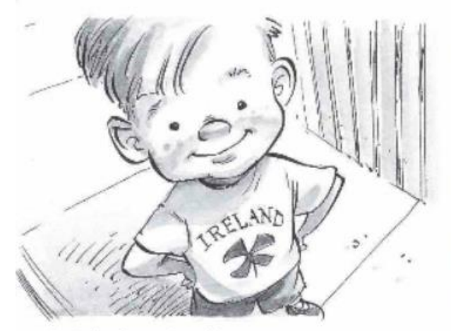
1. A: Is he from Brazil?