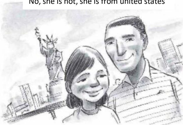
5. A: Are they in Jakarta?

No, she is not, she is from united states