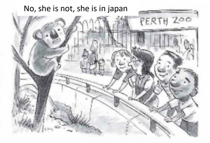
6. A: Are they in Australia?