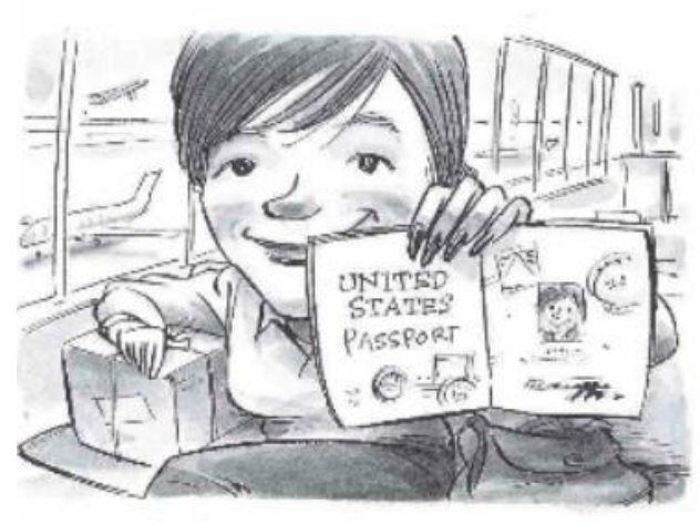
3. A: Is she from Canada?

B: ___ Yes, they are, they are from Delhi