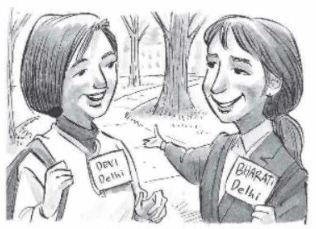
2. A: Are they from India?

B: ___ Yes, they are, they are from Delhi