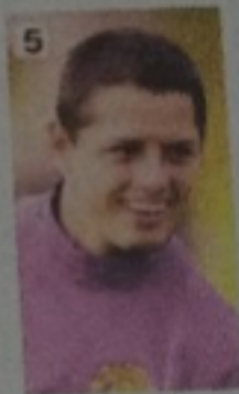
5 Javier Hernández