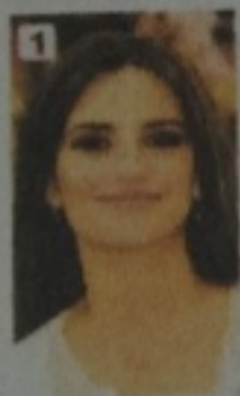
1 Penelope Cruz

A Where are these people from? Check (✓) your guesses.