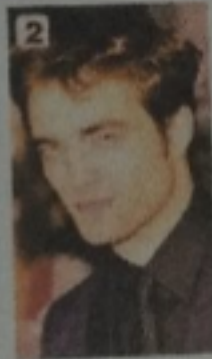
2 Robert Pattinson