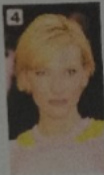
4 Cate Blanchett