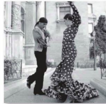
9. They're dancing