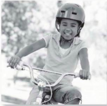
4. She's riding a bike