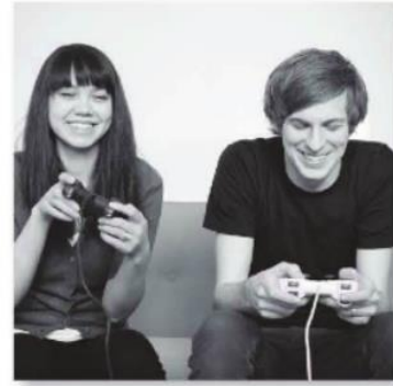
3. They're playing a video game