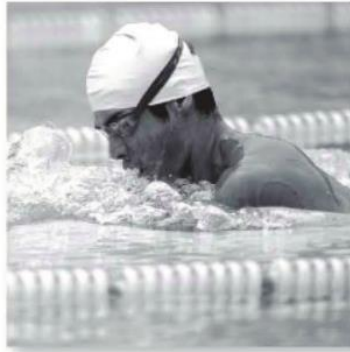
2. He's swimming