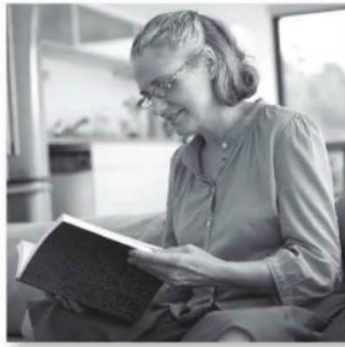
8. She's Reading a book