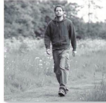
6. He's taking a walk