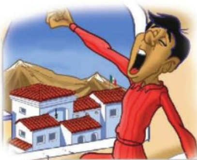
Mexico City 6:00 A.M.