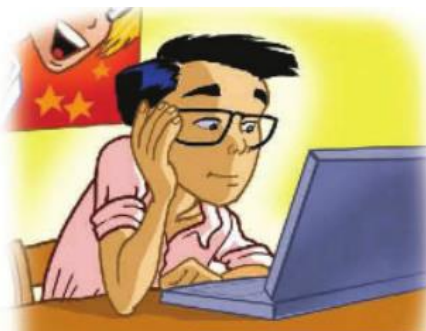
Tokyo 9:00 P.M.