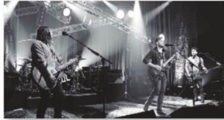
2. The Kings of Leon are A rock band