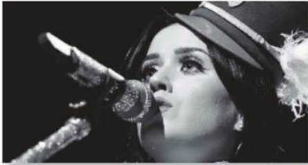
1. Katy Perry is A singer