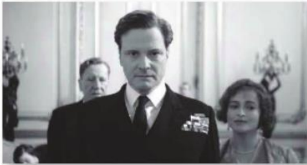
3. Colin Firth is An actor