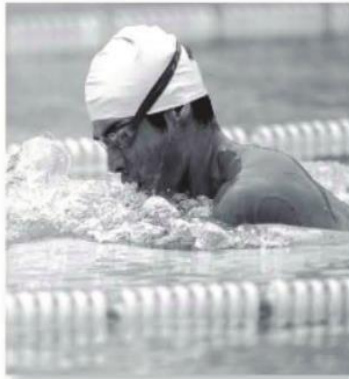
2. He is swimming