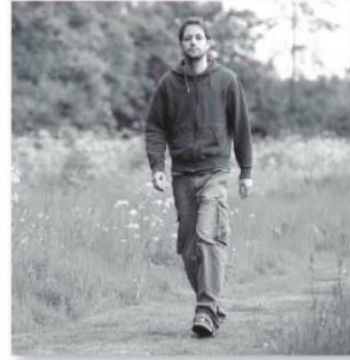
6. He is taking a walk