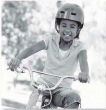
4. She is riding a bicycle