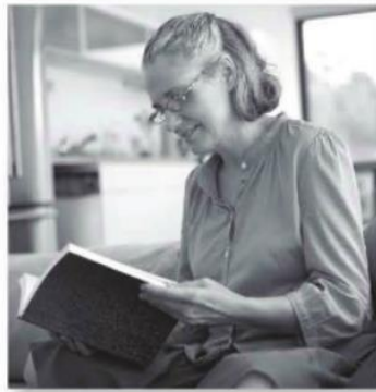
8. She's reading a book