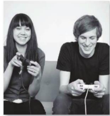
3. They are playing a video game