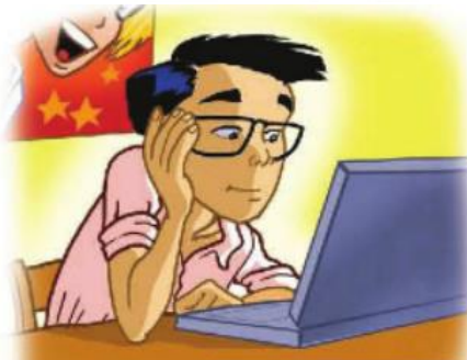
Tokyo 9:00 P.M.