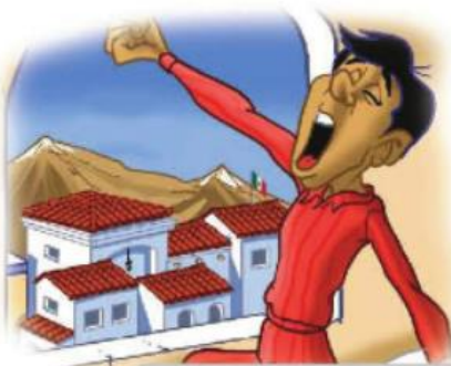
Mexico City 6:00 A.M.