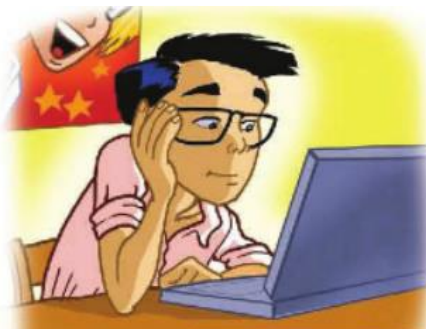
Tokyo 9:00 P.M.