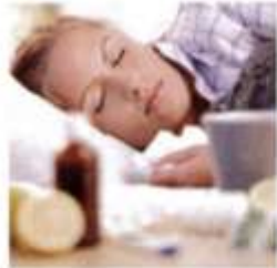
2. lie down