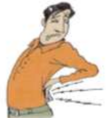
5. a backache