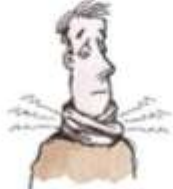
7. a sore throat