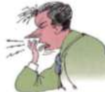
9. a cough