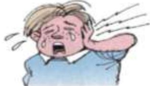
3. an earache