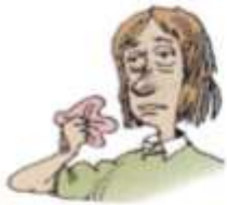
6. a cold