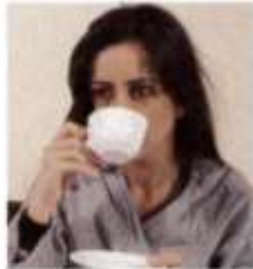
3. have some tea