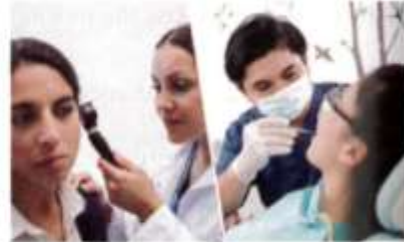
4. see a doctor/ see a dentist