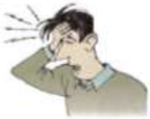
1. a headache