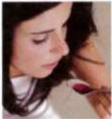
1. take something