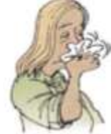
10. a runny nose

Exercise 2. Translate to Spanish the vocabulary above. Traduce al español el vocabulario de arriba.