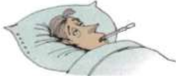
8. a fever