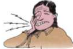
4. a toothache