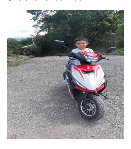
He's my nephew.