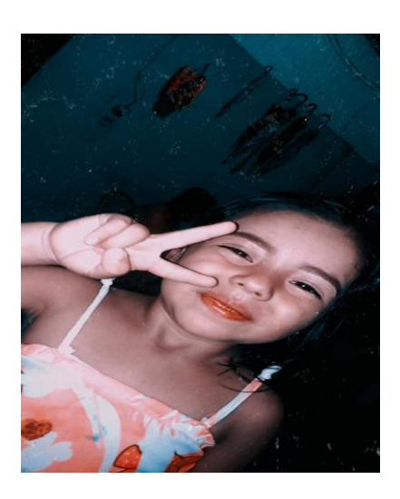
She's my little sister.