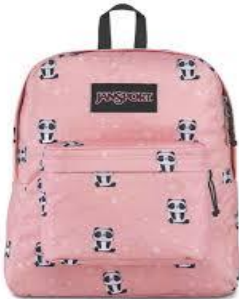
THIS NOT IS MY BACKPACK (ESTA NO ES MI MOCHILA)