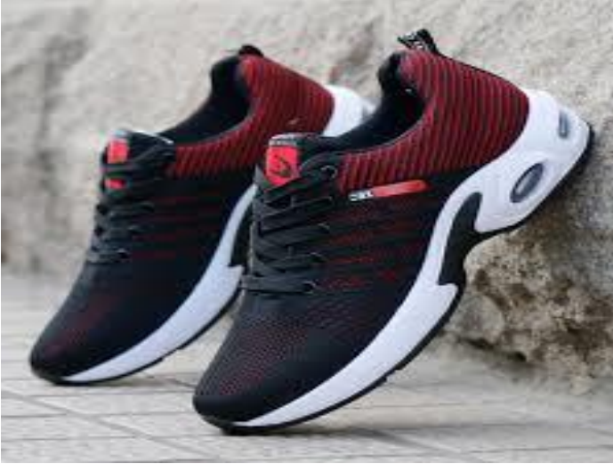
THIS IS MY SHOES (ESTE ES MI TENIS)