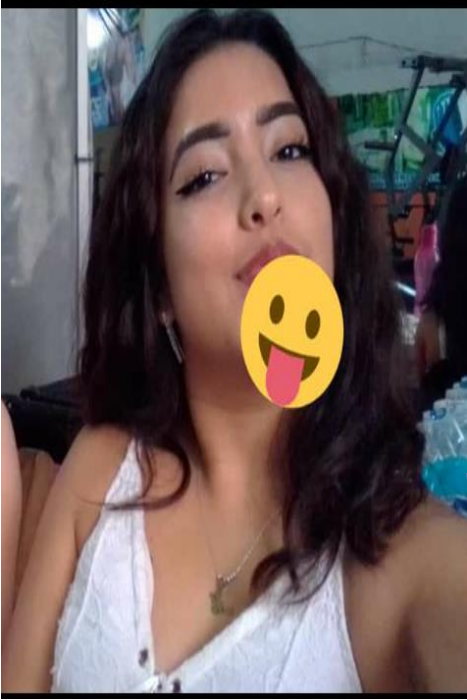
1. - This is my friend.