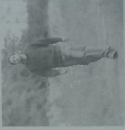
6. he is taking a walk