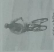
ride a bike