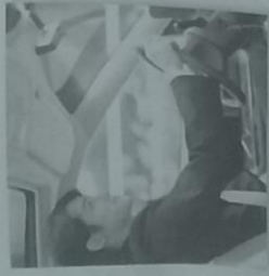
7. he is driving