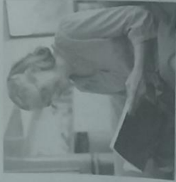
8. she is reading a book