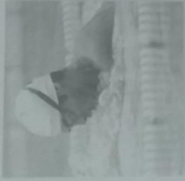
2. He is shopping.