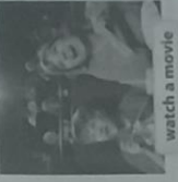
watch a movie