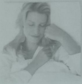
1. She's sleeping.