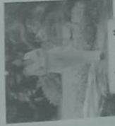
take a walk