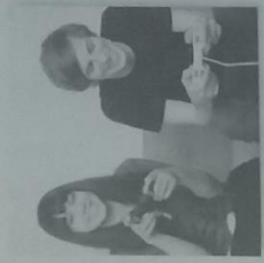
3. they are playing video game