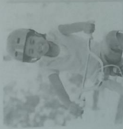
4. she is riding a bike