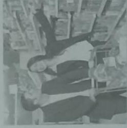
5. she is shopping