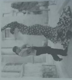
9. she is dancing